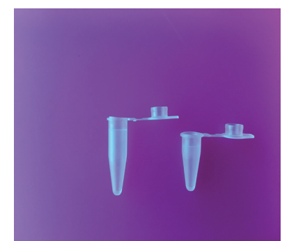
B77301 & B77201