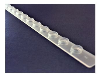
B56501 Robust, indented flat cap-strip Great solution for storing samples