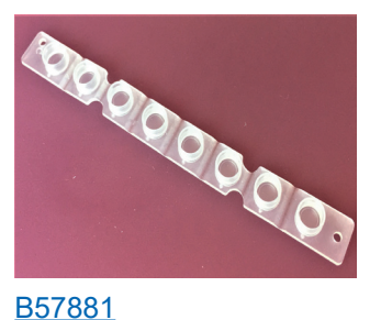
Strip with flexible connections between the caps Extra secure closure