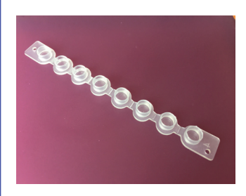
B79701-1 Robust, yet flexible cap-strip

Indented caps greatly reduce potential contamination by hands