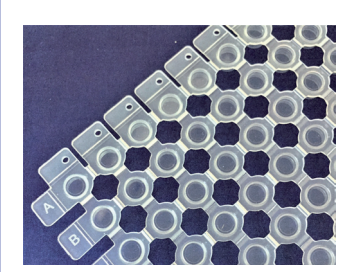
96-cap Transformer ™ plate Easy to cut into any required format