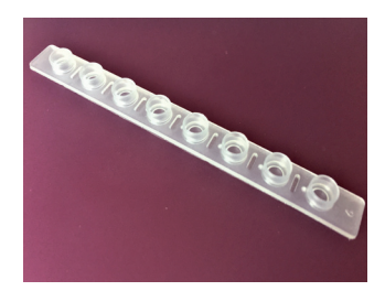
B75701-1 Extra robust, indented flat cap-strip Great solution for storing samples