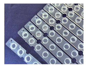
B57651 12 x 8-cap B58671 8 x 12-cap Tear Off strip mat Strips are slightly attached to each other so you can easily tear off one or multiples 8- or 12-cap strips

Designed and manufactured in The Netherlands. Samples on request.