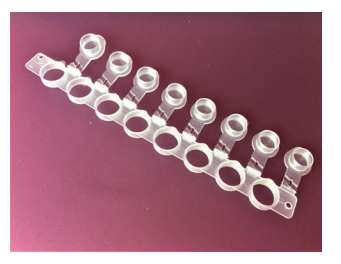
B79501 8-single attachable indented caps Ideal for real-time applications in combination with white or frosted tube strips Can close BIOplastics products: B77001-11 K77001-11 B 77101-11 K77101-11