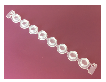
B79721 Flexible strip through thin cap to cap connections Easy to cut with scissors or knife