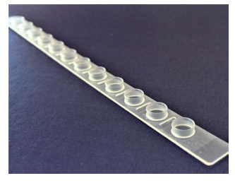
B57821 Optical wide area indented flat cap-strip Robust strip